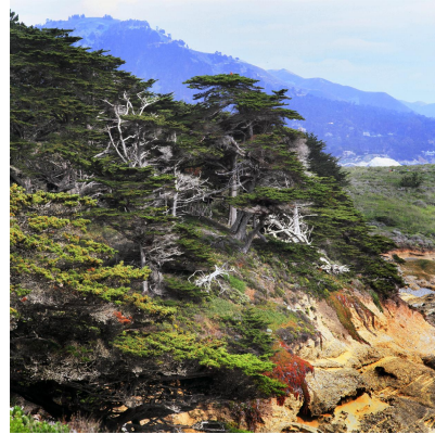
"Point Lobos #2" - Point Lobos, CA © 2008

Sometimes a photo just grows on you. And that is the case with this photo taken last year at Point Lobos, California. It probably does not follow any rules of composition but there is something about it I just like. I have become impressed with the vivid color and detail that this photo possesses. Point Lobos is a fantastic place. It is south of San Francisco about 60 miles. Pebble Beach is across the bay from here. The whole northern California coast is a photographer's dream.