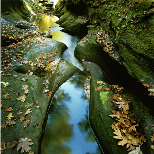
Fall Creek Gorge - The Potholes #1 © 2008

Besides teaching classes for DACC, I also try to offer classes, workshops, photo trips and tours that you want. This fall, I will be offering one workshop and one photo tour.