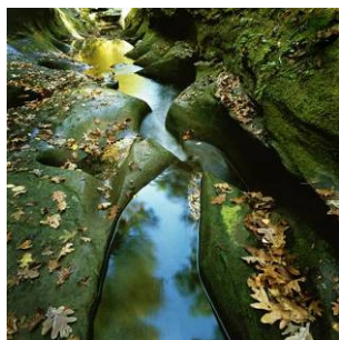
Fall Creek Gorge - The Potholes #2

The digital workshop portion of the tour will run from 6:00-8:00pm, Indiana time at the Warren County Learning Center in Williamsport, IN. The tour will begin at 7:00am Indiana time leaving from the Warren County Learning Center. The cost for this tour is $25.00. Participants will be responsible for their transportation and lunch. To register, contact the Warren County Learning Center at 765-764-1880 or email at WarrenCountyLearningCenter@live.com