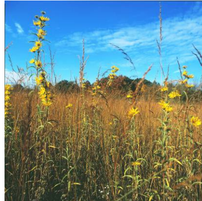
Kennekuk Prairie ©2011

Although I took this photo last fall, surprisingly, it has become a favorite at the show circuit this summer. As with most of my color photos, I am still shooting medium format color film, but then scanning the transparencies.