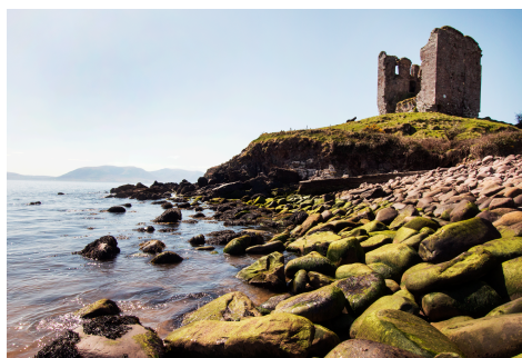
Minard Castle - Dingle Bay, Ireland

Camera - Canon 70D with 10-22 mm lens at 10mm Exposure - 100 ISO - 1/60 sec at f/22